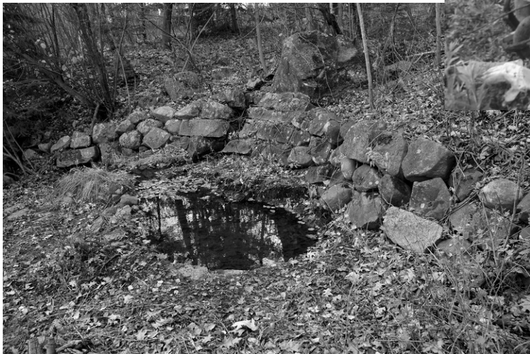
Stop by and see the reflecting pool. The small stream above is intermittent but the stone pool area is holding water.