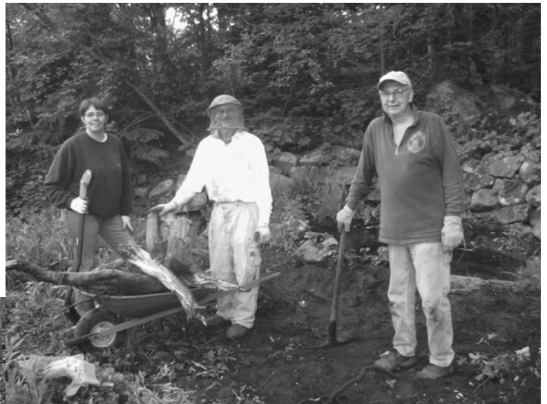
Photo below: In 2008 SPPA volunteers helped clear away root remnants and accumulated soil.

The area was a picnic grounds on the upper level. This photo was taken in the late 1930s.