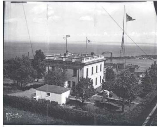
The Weather Bureau building, 631 W. Skyline Parkway, built in 1904 is pictured here in 1930. The instrument shelter was located on ground to the right of the building. The tall tower with the flag was a weather reporting device. Pictured in the near lower right of the picture is the Incline Railway.

If you drive along Skyline Parkway in the 600 West block you will encounter a stone wall at 631 W. Skyline Parkway (upper side). A small wooden bus shelter is visible on the grounds above the wall. Behind that you hardly see anything except for shrubs. The house behind the shroud of bush is the old 1904 Weather Bureau building still standing even though its weather station days are long gone. Likewise, the large weather tower is no longer present even though the area behind the building is loaded with assorted towers today. The